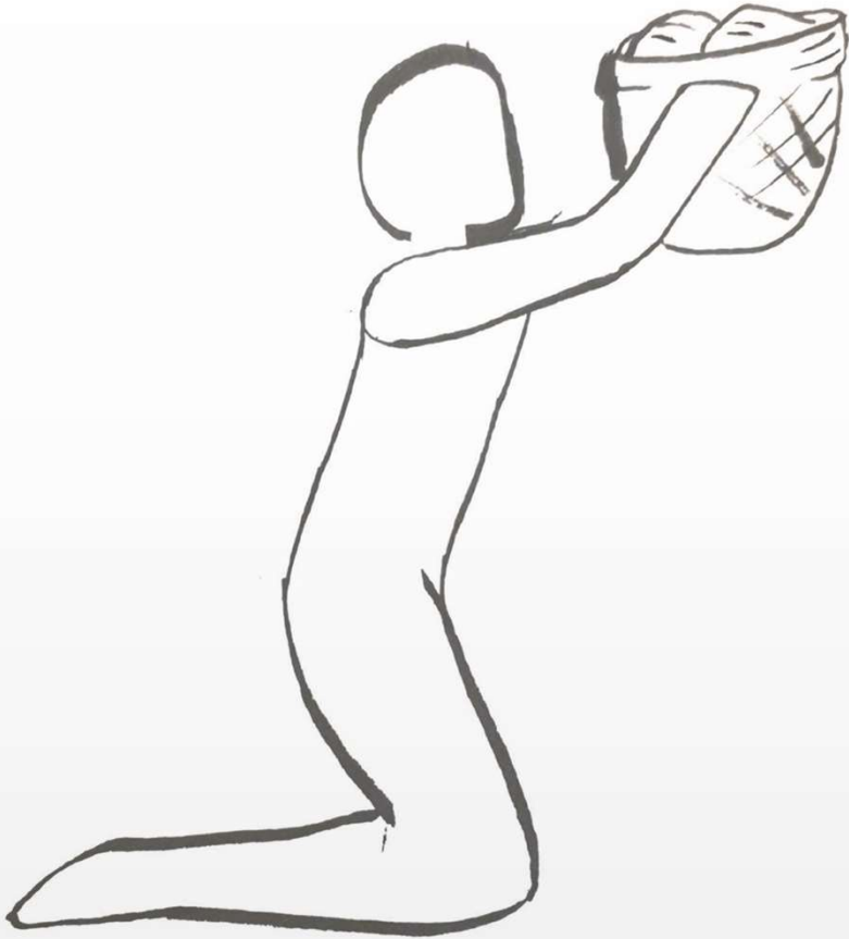
Illustration: Julina Nishimine